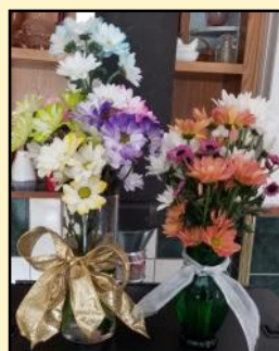
Bouquets of fresh flowers are sent to ill members.

The Senior Group has been blessed with generous contributions by private donors and many organizations like the CRR Lions Club, Steel Stampede, The ATV Group, also, the CRR Golfers.