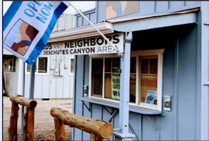
Photo by FANs building in the Canyon Village at Crooked River Ranch.

Come and join us for a tour of our FANs Building. Learn about our public lands stewardship projects, guided hikes for 2023. We will be leading a tour of the Native Garden and talk about planned upgrades. Children are welcome and will be able to experience our "Wildlife Tracks" program-test your knowledge about the hoof and paw prints on your driveway or trails. Our new, hot off the press, Guide to Common Birds of the Deschutes Canyon Area, will be available to purchase. But why wait! The new bird guide can be viewed and purchased through our website: www.fansofdeschutes.org The new updated Guide to Native Plants of the Deschutes Canyon Area is also available. In fact buy all three guides, including the Guide to Common Weeds, for a discounted price.