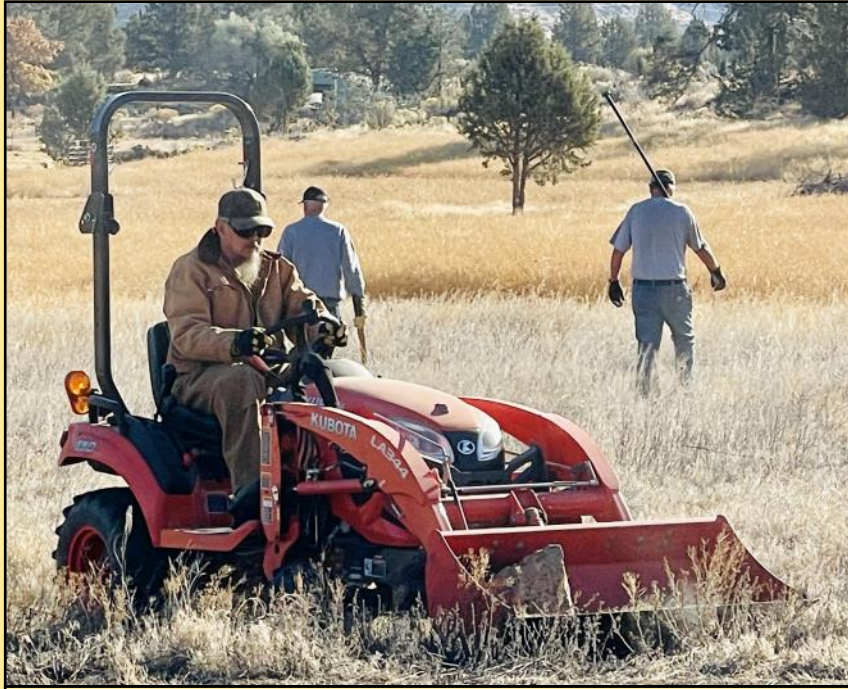
Pictured above and below: Volunteers help at October's fire abatement project.

We're looking for volunteers to help with the trimming of the Juniper trees in the lower pasture between Chinook and Buffalo Place. This is a continuation of the fire abatement project held in October of last year. The scope of this project is to remove the lower limbs up to around 5 to 6 feet above ground on the larger trees and remove the smaller trees. We're scheduling this project to take place on April 15 th starting at around 9:00 a.m. This is being scheduled on the same day as one of the Community Garden kick-off events across the road. We're doing this because the Community Garden events are happening on the 1 st and the 15 th and didn't want to add another volunteer day in April. Should be plenty of room for both events.