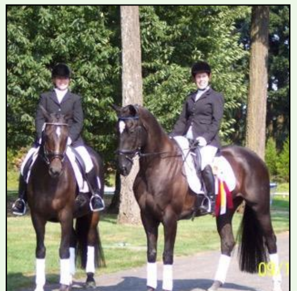
Besties at the show.

Assuming that you have sorted out your reasons for showing, there are a few basic preparations that you will want to pay attention to. The first important preparation