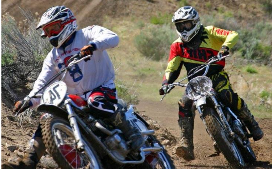
Rounding the curve.

All Steel Stampede events have been held for one purpose; to benefit the community. Proceeds from the initial event were earmarked for the Fire Hall with proceeds from subsequent events benefiting the community at large. Past projects, which were provided for the community with proceeds from the event, include the restrooms by Lions Memorial Park, the upper-level visitor's kiosk, Coyotes Den Disc Golf Course, bleachers, chips for the walking trail at Panorama Park, the bocce ball court and a new children's playground. Currently the Ranch Enhancement Committee reviews requests for funds for different projects with recent completed projects including Pickleball Court improvements, new fencing at MacPherson Park and by the Trading Post and rock work by the First Responders and Veterans memorial.