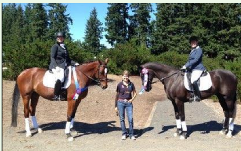
A proud trainer with her clients.

Alphabet Soup - Recognized Shows - A, B, & C level shows/ Recognized Shows Recognized shows are shows that are recognized by the governing body or bodies of the different horse sports. These include USEF, USDF and various breed and specialty organizations like the American Quarter Horse Association (AQHA) or The American Driving Society (ADS). These are larger and formal events that will draw competitors from a bigger area. They are often quite expensive. The competition at these events can be quite sharp, and you will be happiest if you have been working with a trainer familiar with your sport who can tell you if you are ready to compete. These events have stricter dress and tack codes that are often spelled out in the governing body's rule book. If you are a newbie, consider spectating first or grooming for friends as a way of finding out if you would want to participate as a competitor.