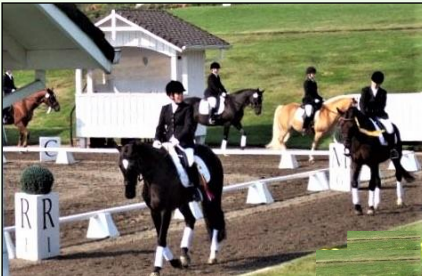
Hard work pays off in the victory lap.