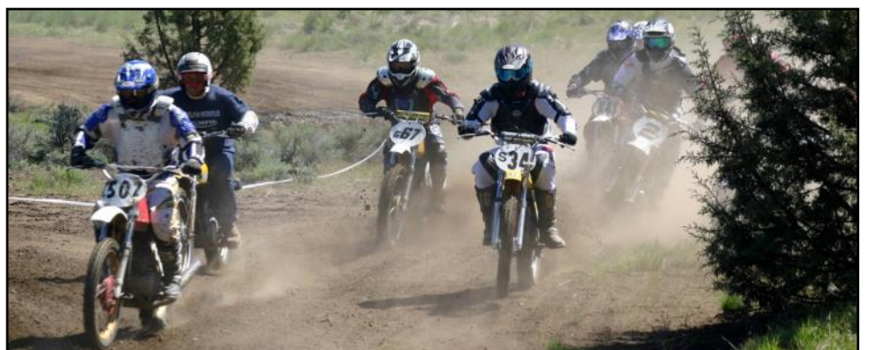
Let the races begin!